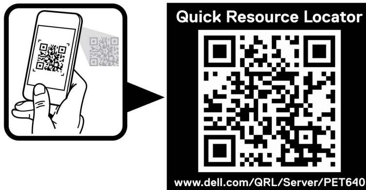
Figure 2. Quick Resource Locator for PowerEdge T640